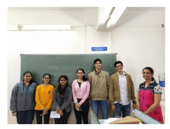
Winners of the Word Search Puzzle game