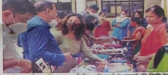
सेवा सहयोग फाउंडेशन द्वारा प्रशिक्षित महिलाओं के उत्पादों की बिक्री हेतु लगाई गई प्रदर्शनी को नागरिकों से अच्छा रिस्पॉन्स मिला.

बेरोजगारी की वजह से हुई निराशा की जगह अब आत्मविश्वास ने ले ली है. हमें विश्वास हो गया है कि हम अपनी कला का उपयोग कर पैसे कमा सकती हैं. इस कार्यक्रम में पुणे परिसर की 50 महिलाएं व कई स्वयंसेवक शामिल हुए. सेवा सहयोग फाउंडेशन पिछले 15 सालों से पुणे व मुंबई परिसर में समाज के आर्थिक रूप से कमजोर वर्ग के लिए शिक्षा, स्वास्थ्य, स्वच्छता एवं आत्मनिर्भरता आदि क्षेत्रों में