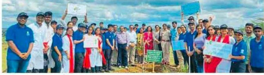
देऊळगावगाडा (ता. दौंड) : वृक्षलागवड करताना वनविभाग व फार्मसी कॉलेजचे एनएसएसचे विद्यार्थी.

दौंड तालुक्यात वनविभागाच्या वतीने हिंगणीगाडा, रोटी, देऊळगावगाडा आदी वनक्षेत्रात वडाच्या झाडांच्या योग्य आकार व उंचीच्या फांद्या लावण्यात आल्या