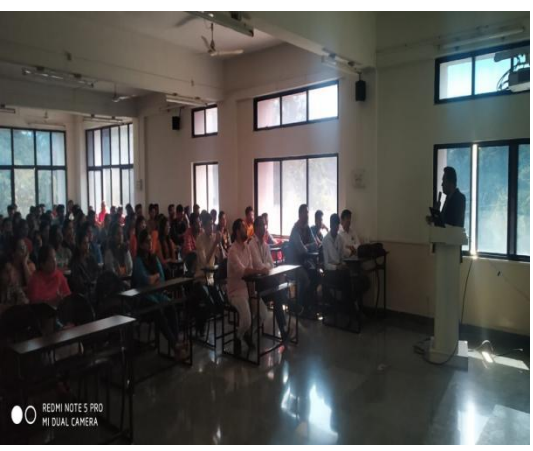
Interaction with Audience