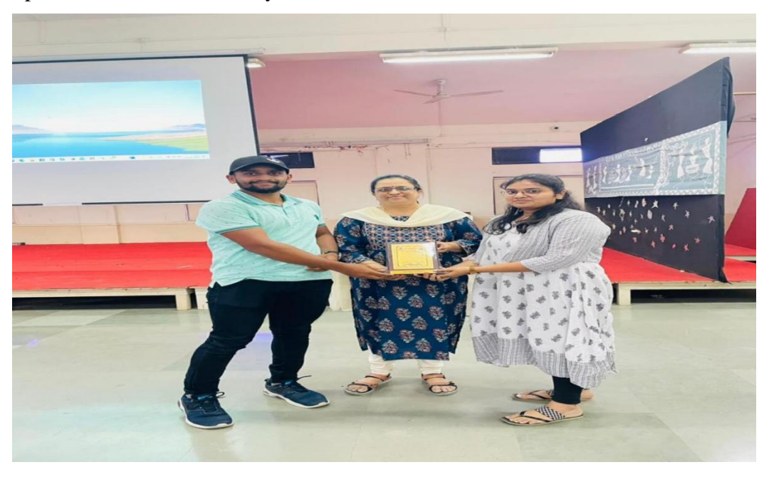
Felicitation of the speaker by Class Representatives